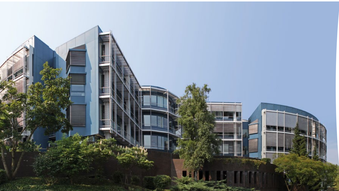
Thieme Headquarter in Stuttgart, Germany