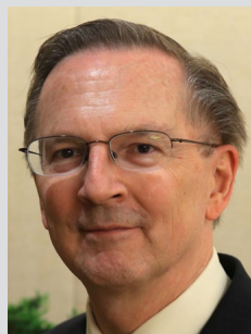
Dr. J. W. Szostak